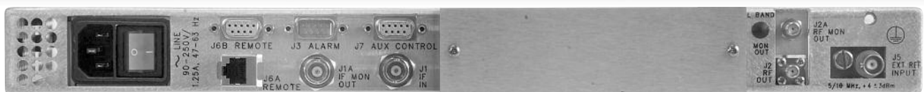
RSM Switch Module Location (see D-323 for more information)